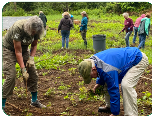
In July, volunteers helped remove invasive species and cover the field with black plastic.

Successfully establishing a perennial wildflower meadow takes several years, starting with elimination of existing grasses and perennial weeds. We opted to use a process called "smothering." To start, the field was mowed as short as possible with a brush mower several times in the spring and early summer to weaken existing vegetation. Next, the entire area was covered with heavy-duty black plastic which excludes light from the weeds growing underneath and eventually kills them. Due to the tenacity of the invasive plants in this area, the tarps will remain in place until the fall of 2026.