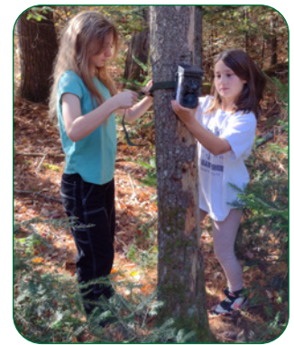
5th graders at Danbury Elementary School set up a camera behind the playground.

Squam Lakes Natural Science Center is proud to be the convener of the Squam Lakes CLE. By supporting educators in collaborating on meaningful environmental education experiences for students throughout the Lakes Region, we expand our impact beyond what we could achieve on our own.