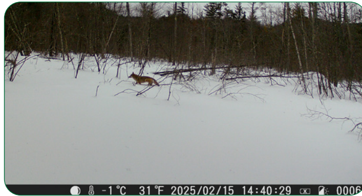
Caught on camera: a coyote crossed a frozen pond in the Hebron Town Forest.