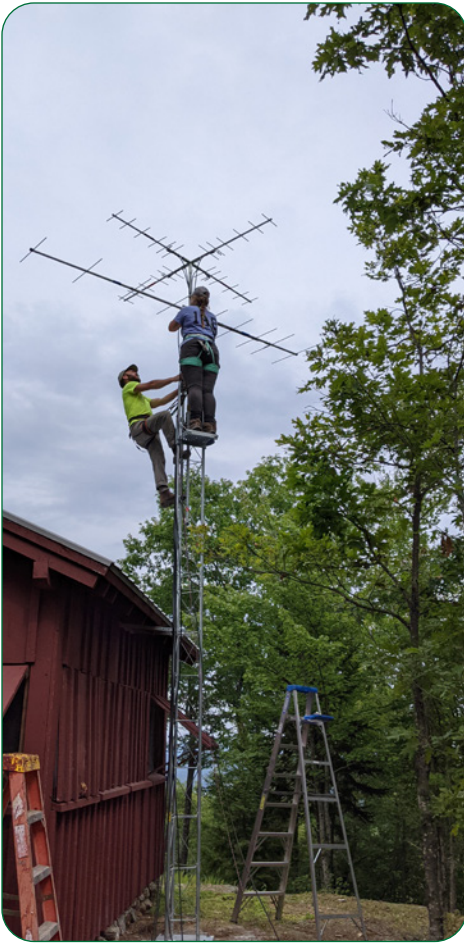
Installation of a Motus Receiver Station in New Hampton.

stations. Typically, the stations are located on high terrain where there is a good “viewshed” to maximize detections. As of this writing, there are over 2,000 receiving stations in 34 countries and more than 49,000 animals tagged. Here, in New Hampshire, we currently have 17 receiver stations.