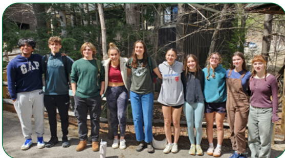
High School SAS organizers.

Planned and led by high school students passionate about enacting climate action projects at their school and in their community, the second annual Middle School Sustainability and Action Summit brought together 60 middle schoolers for a day of hands-on learning. Hosted at the Science Center, this student-led conference featured workshops covering the topics of renewable energy, the importance of pollinators, waste reduction and composting, and sustainable eating and cooking. Representing schools as far north as Bethlehem and as far south as Nashua, the event doubled in size from its first year, with middle schoolers from ten schools all over the state in attendance. Some activities included conducting an energy audit of the facility using power meters during the green energy workshop, clearing a future pollinator garden space during the pollinator workshop, baking muffins with local ingredients during the cooking workshop, and compost-themed Jeopardy! during the waste reduction workshop. Teachers and chaperones participated in a separate workshop on how to support students in taking action in their local communities.