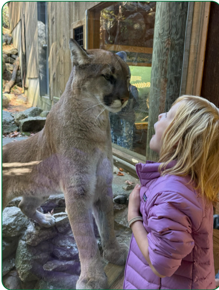
Mountain Lion and child marvel at each other at the Mountain Lion Exhibit.

Usually his antics would thrill the family, some parents would even encourage their precious defenseless offspring to approach the glass again to repeat the “attack.” The cat’s behavior is natural (maybe not so much the human behavior) and certainly provided very stimulating enrichment for the cats. Unfortunately, Washington would sometimes get so stimulated that he began biting chunks out of the wooden window