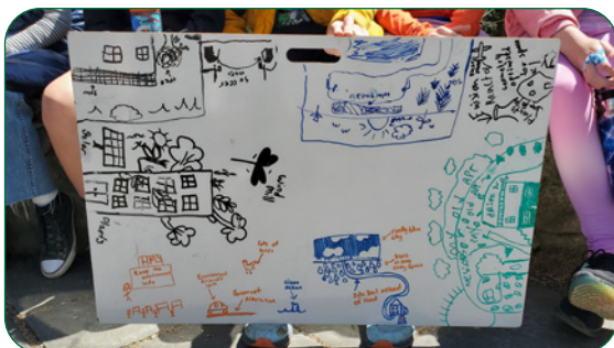
One groups' vision for the future.

The students were also afforded time to regroup with others from their school to brainstorm their ideal environmentally-friendly future, which helped groups to reflect and envision project ideas to bring back to their schools. The enthusiasm from the students was palpable as they enjoyed “being creative while working together,” as one student commented, and the day was an overwhelming success. The summit was jointly supported and organized by members and staff of New Hampshire Environmental Educators, New Hampshire/Vermont Energy Education Program, Hopkinton High School Environmental Action Club, Holderness School Students, Coe-Brown Northwood Academy Youth Environmental Activists, Uplift NH, 350NH Youth Team, Squam Lakes Natural Science Center, Squam Lakes CLE, and Prescott Farm as well as other volunteers from the community.