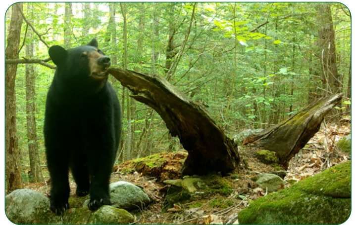
A Black Bear caught on one of many hidden cameras strategically placed around the 207-acre Science Center campus.