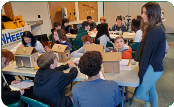
Middle School students working with model houses during the green energy workshop.

Planned and led by high school students passionate about enacting climate action projects at their school and in their community, the second annual Middle School Sustainability and Action Summit brought together 60 middle schoolers for a day of hands-on learning. Hosted at the Science Center, this student-led conference featured workshops covering the topics of renewable energy, the importance of pollinators, waste reduction and composting, and sustainable eating and cooking. Representing schools as far north as Bethlehem and as far south as Nashua, the event doubled in size from its first year, with middle schoolers from ten schools all over the state in attendance. Some activities included conducting an energy audit of the facility using power meters during the green energy workshop, clearing a future pollinator garden space during the pollinator workshop, baking muffins with local ingredients during the cooking workshop, and compost-themed Jeopardy! during the waste reduction workshop. Teachers and chaperones participated in a separate workshop on how to support students in taking action in their local communities.