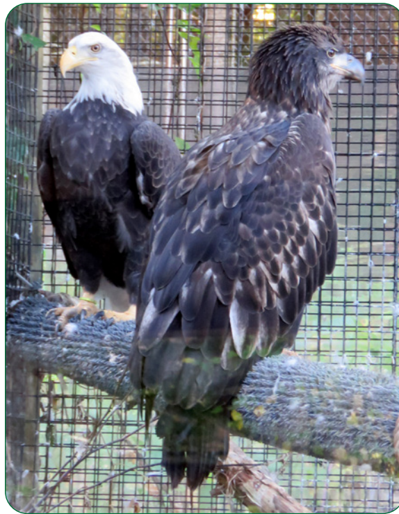
Cody and Jackson at the Science Center.