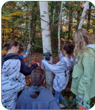
5th graders at Bridgewater-Hebron Village School set up a camera by the back sports field.

seasons at different locations in watershed towns. Students are also responsible for going through the images to identify wildlife and graphing the data from each location. So far, they've found evidence of bears in forests, red foxes by playing fields, and even trick-or-treaters on Halloween. In fall 2025 the project added a new element as wildlife camera kits, complete with user's manuals developed by Plymouth State University students, became available for general check-out at the Minot-Sleeper Library. The images collected give students and campers a chance to think about the relationships between wildlife, humans, and habitats while also working on data interpretation & analysis.