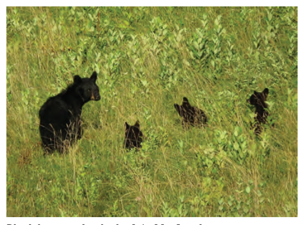
Black bear and cubs