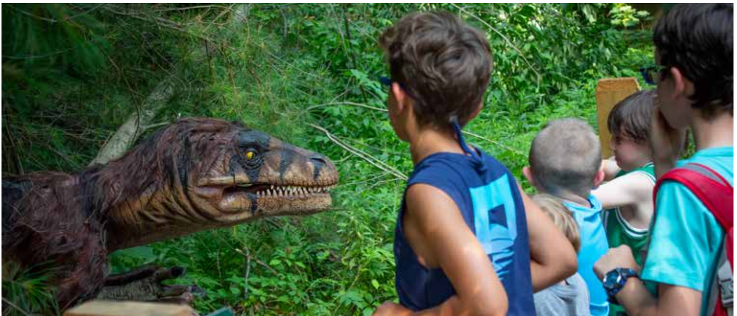
Children watch the Deinonychus at Dinosaurs Alive!