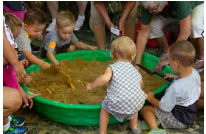
Children dig for fossils during Dinosaur Day.