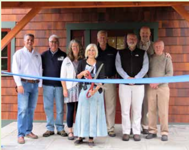
Blue Heron School began its tenth year in its new location with 39 students, thanks to funding from the Education Matters Capital Campaign.