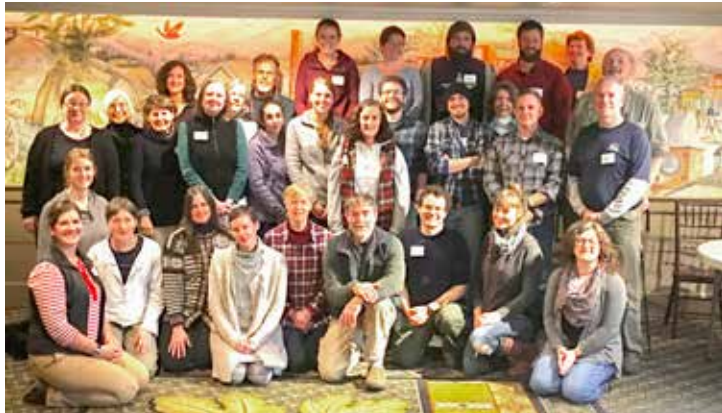
November 2019 Staff Retreat

of Squam Lakes Natural Science Center is to advance understanding of ecology by exploring New Hampshire's natural world.