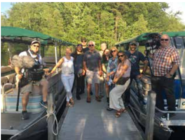
Samantha Brown's Places to Love visited in June. The "Lakes & Mountains of New Hampshire" episode aired in March 2020.