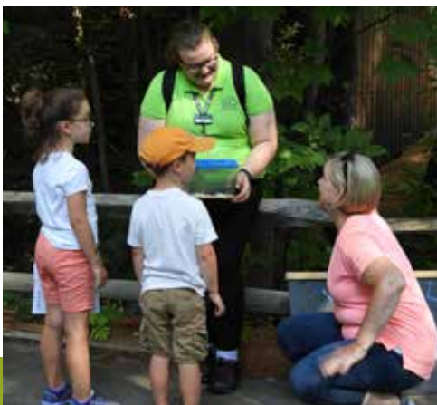
The First Guides Teen Volunteer Program celebrated 10 years with over 100 teens ages 14 to 17 completing the program, some returning as docents. In 2019, the teen participants focused on community action projects such as trail maintenance and invasive species removal with Squam Lakes Association, a loon census with Loon Preservation Committee, bat counts for the NH Bat Colony Count, and invasive plants removal at the Science Center.

→ Science Pubs, held at local restaurant Walter's Basin, were popular with area adults. These off-season evening programs and community discussions were held in collaboration with Squam Lakes Association and Squam Lakes Conservation Society and will continue.