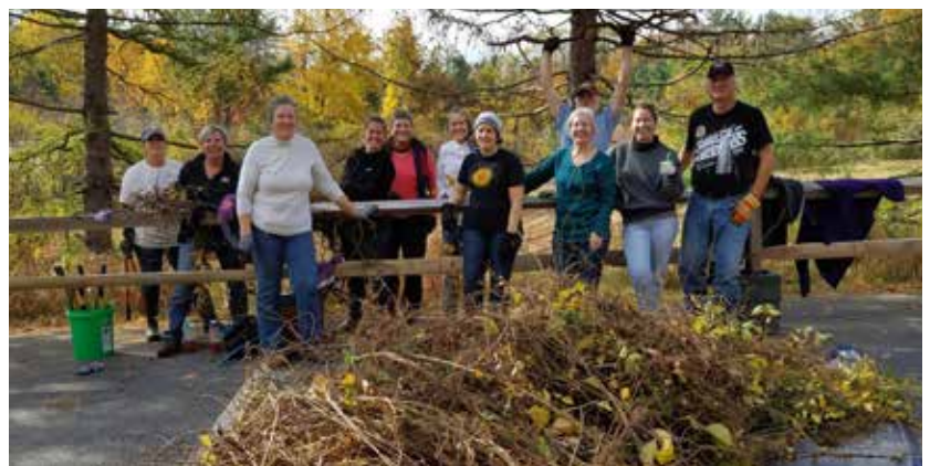
Natural Resources Stewards worked to clear invasive plants.