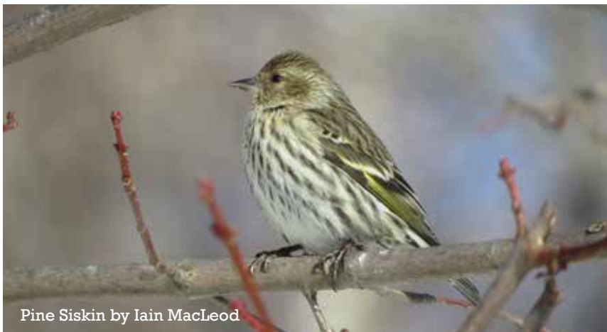
Pine Siskin