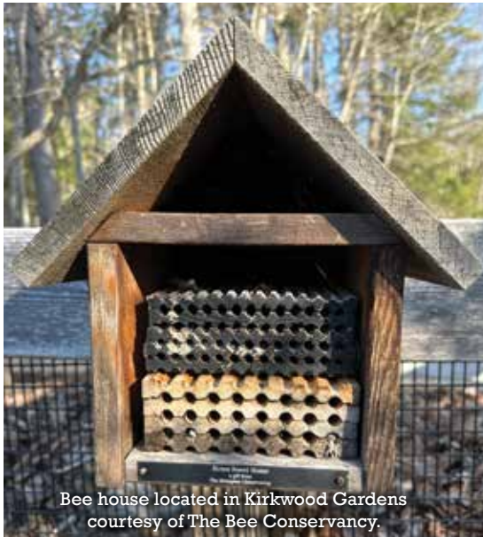
Bee house located in Kirkwood Gardens courtesy of The Bee Conservancy.

I nurture helping solitary bees? What kind of bees will visit my vegetable garden? Will I see more native bees rather than the honey bees from the neighbor's bee hive? Maybe you too have questions about solitary bees. I hope, like me, you will be enticed to look for the answers wherever flowering plants, holes in trees, and amazing solitary bees and their homes come together.