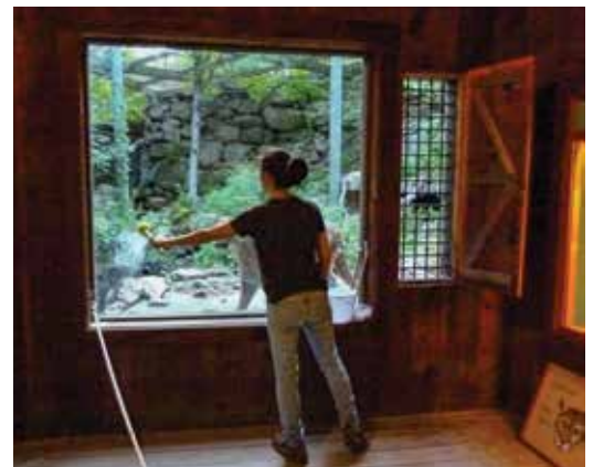
Lauren Moulis works on training with our previous mountain lions.

The training of mountain lions for voluntary health empowers the animals to participate actively in their own healthcare, promotes their well-being, and helps us better understand their health needs.