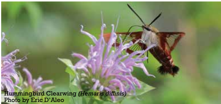
Hummingbird Clearwing ( Hemaris diffinis )

Hummingbird moths are actual moths although they may not look like what you might expect. There are two species found in New Hampshire, the Hummingbird Clearwing moth ( Hemaris thysbe ), and Snowberry Clearwing moth ( Hemaris diffinis ). Both look similar, but the Hummingbird Clearwing is larger and has an olive colored thorax with a yellow belly, a dark burgundy abdomen, and pale yellow legs. The Snowberry Clearwing is a bumble bee mimic with a golden thorax, a black abdomen, and black legs.