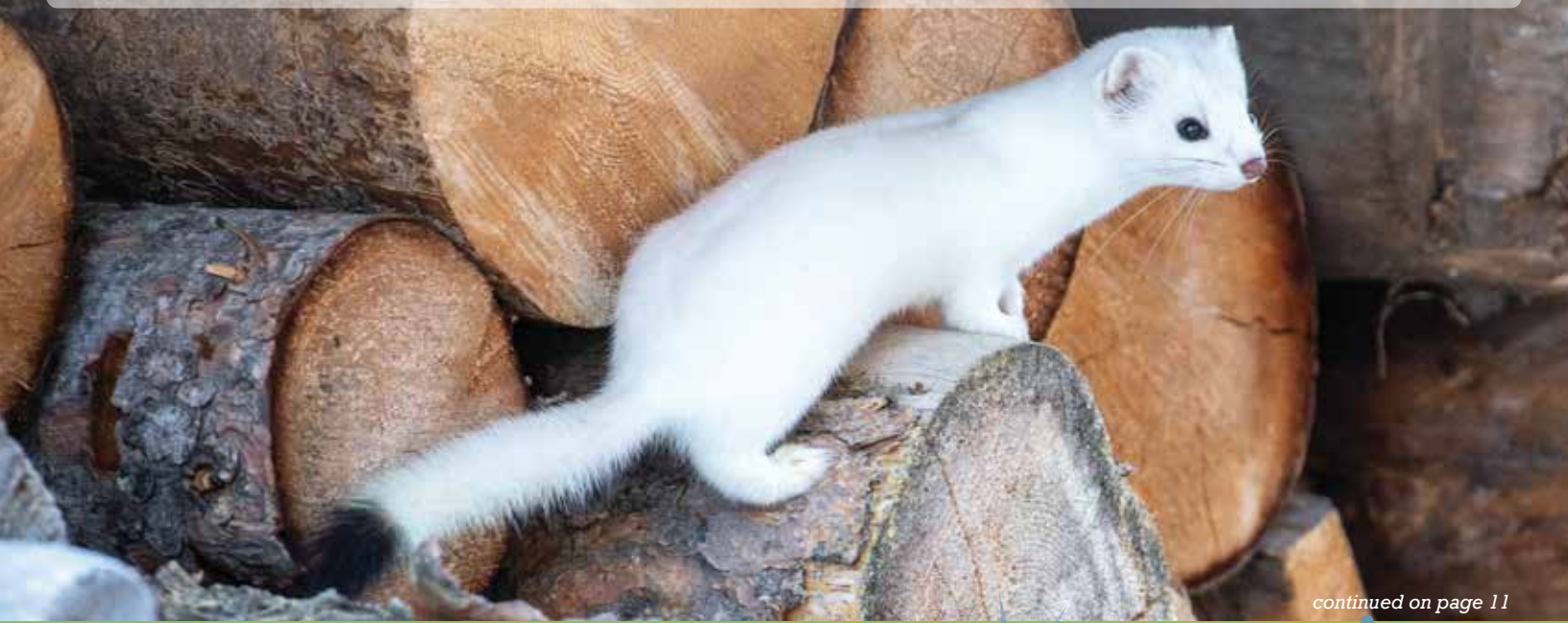
continued on page 11

Enter our second creature which, in contrast, is a predator. How does climate change effect how short-tailed ( Mustela ermina ) and long-tailed weasels ( Mustela frenata ) capture prey while avoiding becoming prey themselves? In winter, these creatures transition from summer brown to winter white. Weasels are relatively small creatures, 7 to 13 inches for short-tailed weasels from nose to tail tip, with long-tailed weasels being somewhat larger. These active hunters are mostly white with a notable exception – they have a black tip to their tail. The advantage of the contrasting dark tail tip is this feature becomes the focus for a predator coming in for a capture rather than the weasel’s head. Predators include owls, mink, foxes, and coyotes. Weasels lose a huge advantage if, instead of blending with their surroundings, their winter white contrasts against a brown leafy forest floor rather than the snowy winter terrain their coats match.